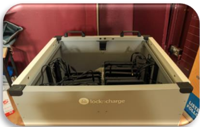
Images taken by the Parents Association and shared at the virtual AGM on the 5 th of October.